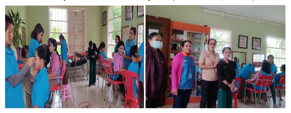
Quarterly Report: July - September 2022 Page 3 of 19