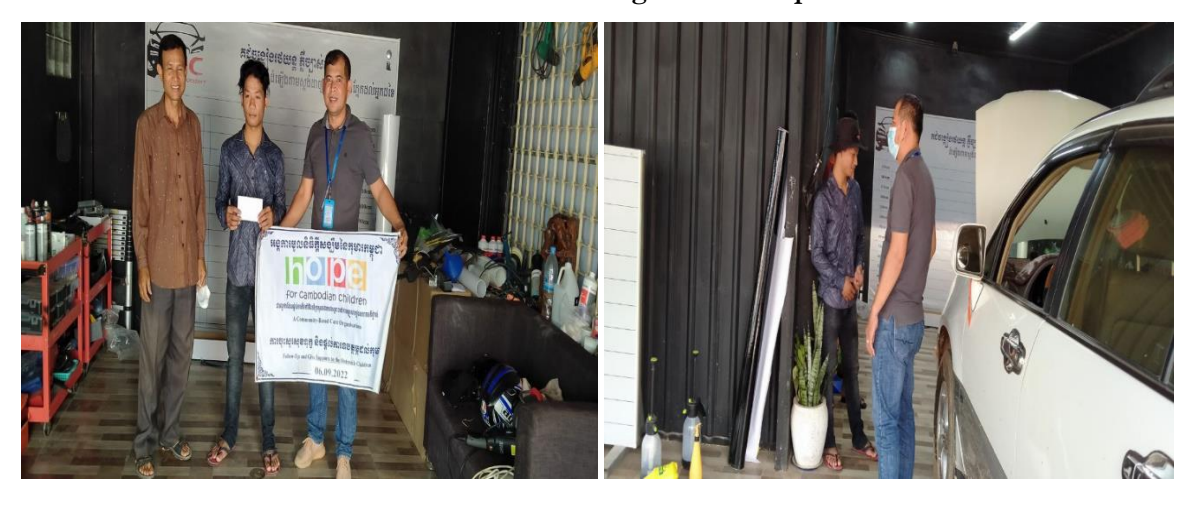
Beauty Salon at Caritas our NGO partner (CCWC, Teacher, and Staff)